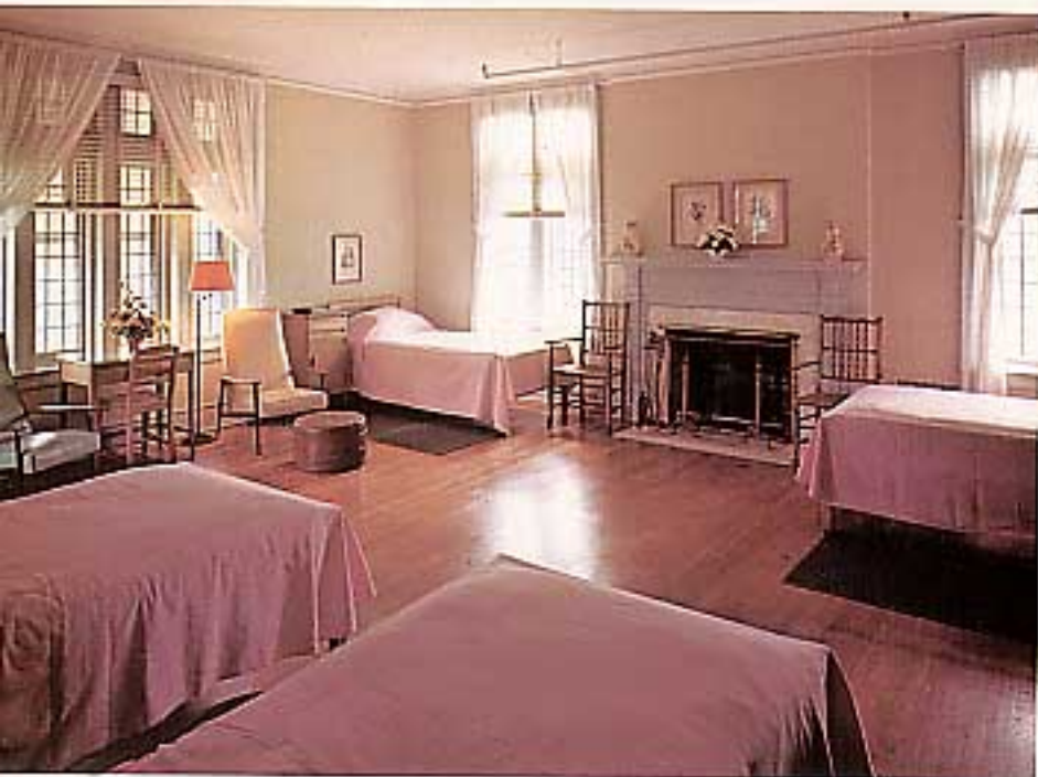
One of the bedrooms at the Kate Macy Ladd Convalescent Home.

The twenty-one bedrooms on the second and third floors of the Home are charmingly decorated in pastel shades. They are attractively furnished – comfortable lounge chairs and desks are provided. Limited drawer and closet space is available for each guest.